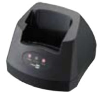
Modem Cradle Ethernet Cradle