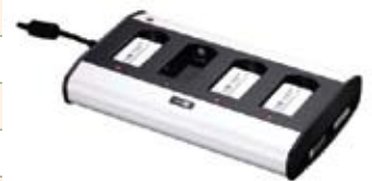
4-slot Battery Charger