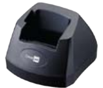
Charging and Communication Cradle